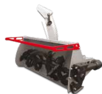
TWO-STAGE TURBINE SNOW THROWER