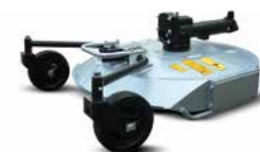
HEAVY DUTY MOWERS